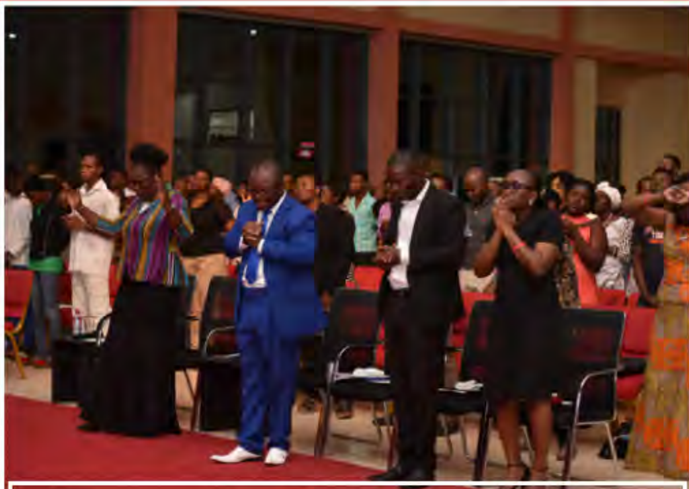
Page 10: KICC Ghana