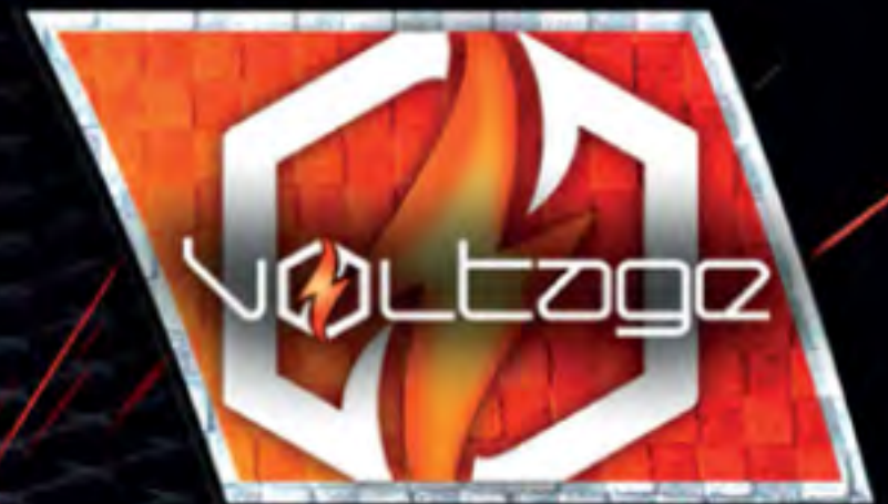
GOSPEL MUSIC GROUP VOLTAGE