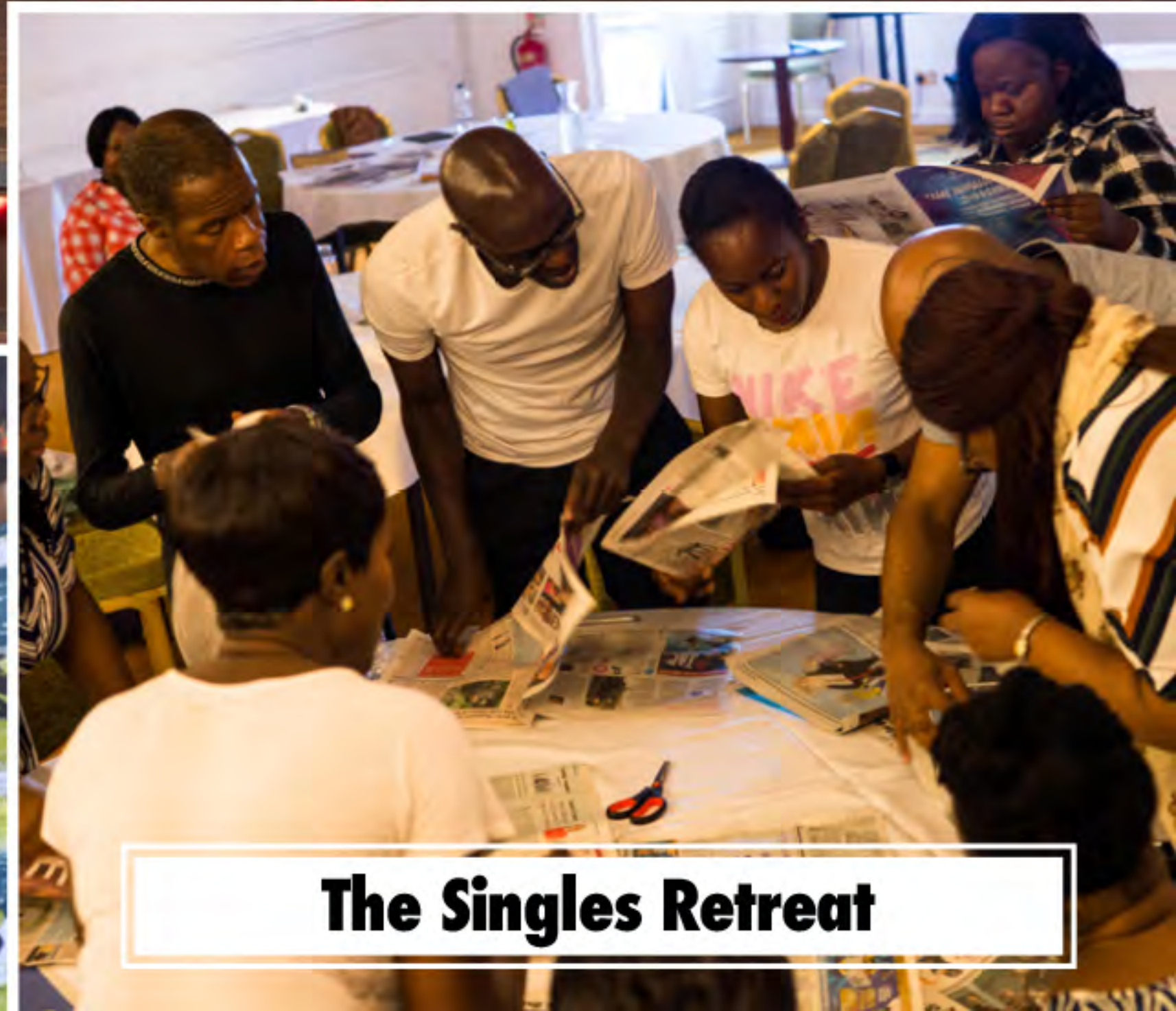
The Singles Retreat