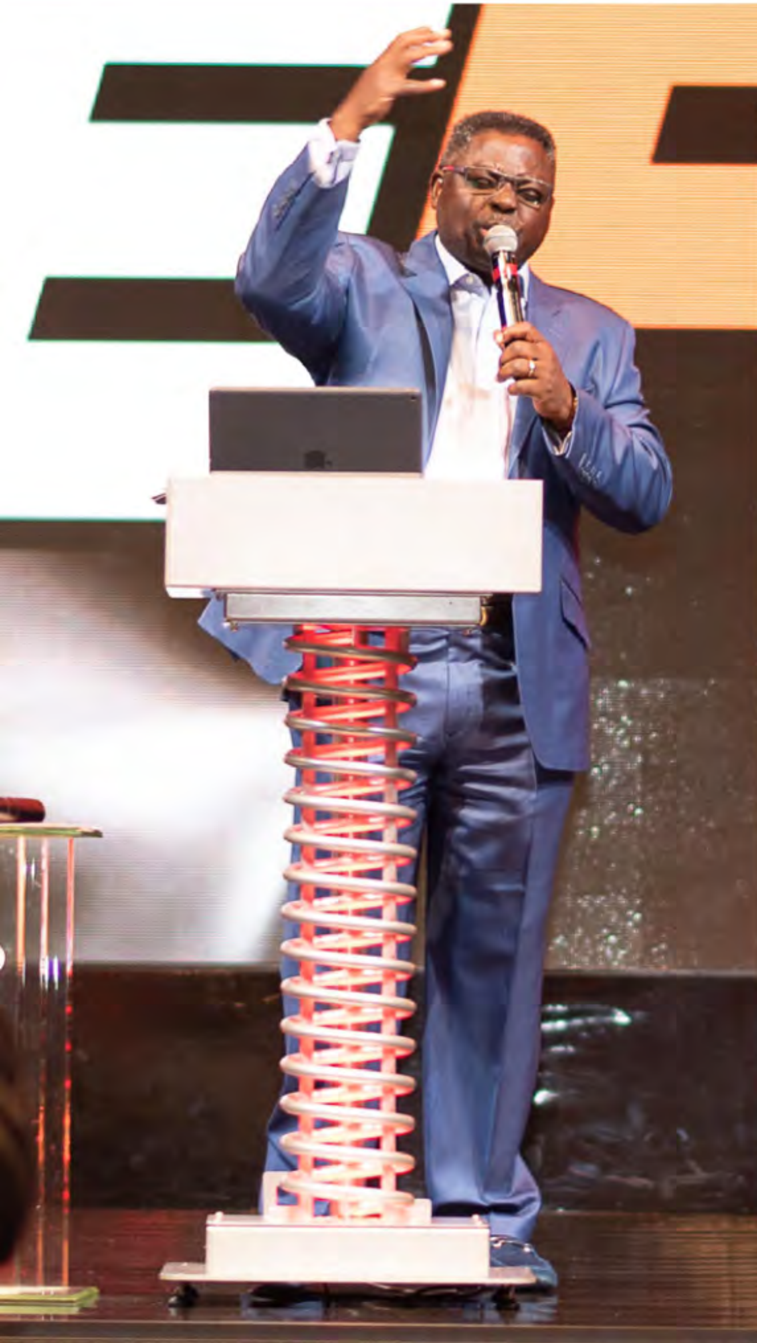
Let The Fire Fall