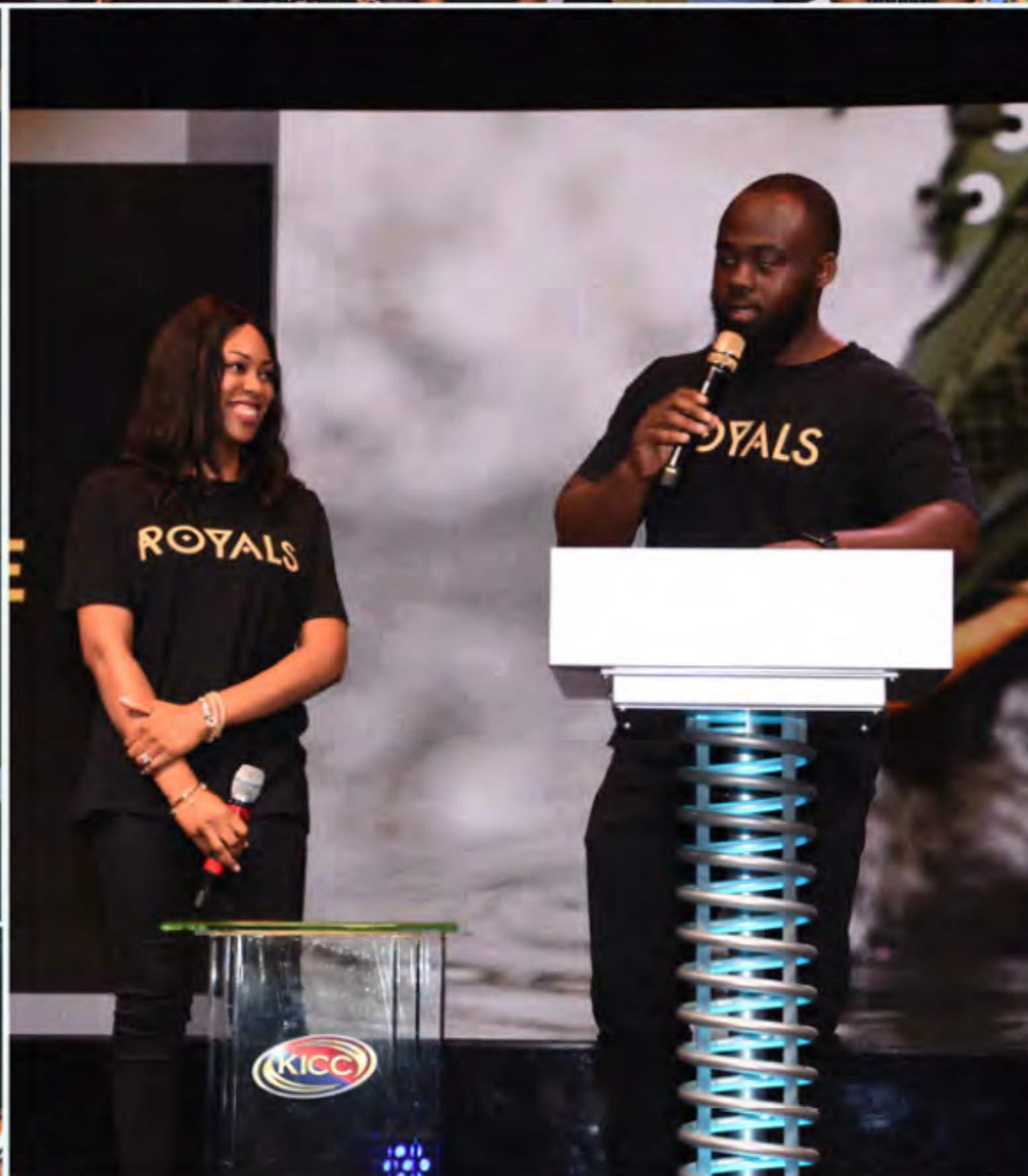
Minister Tobi Ashimolowo