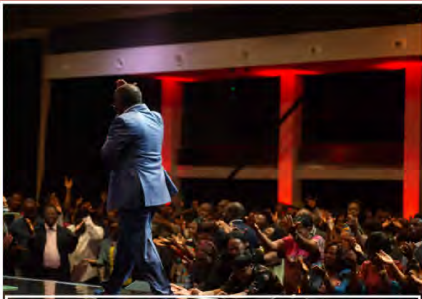
Page 3: Let The Fire Fall