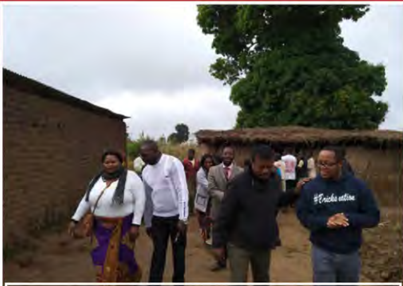
Page 11: KICC Malawi