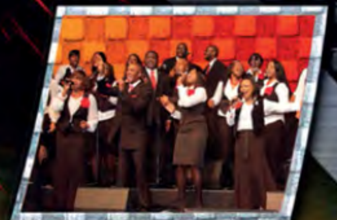
THE KICC MASS CHOIR