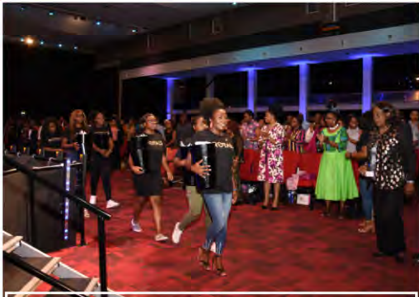
Page 7: The KICC Royals Take Over