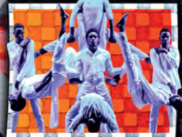
XPREXXIONS DANCE GROUP