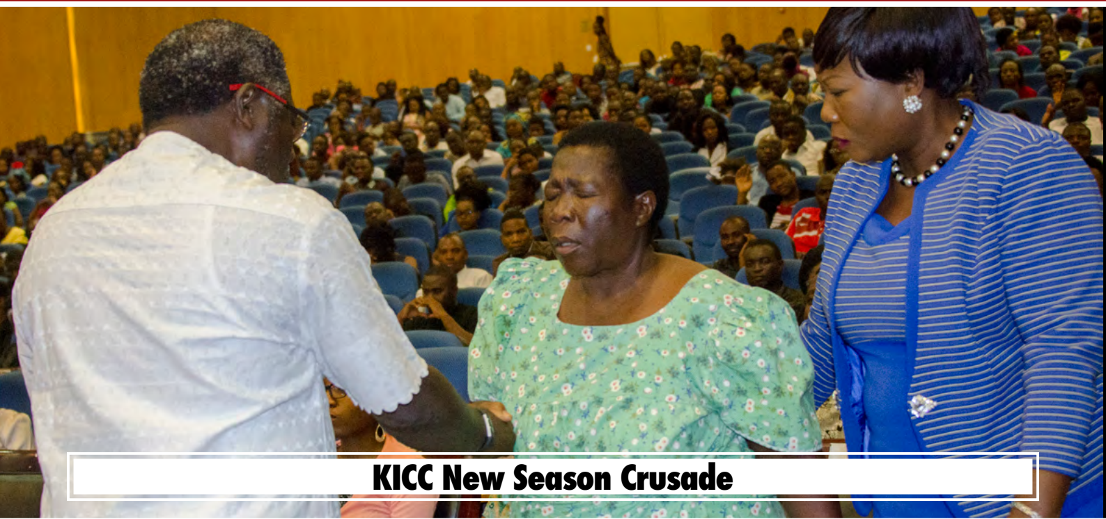
KICC New Season Crusade