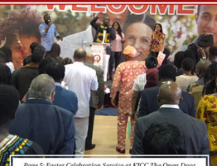
Page 5: Easter Celebration Service at KICC The Open Door