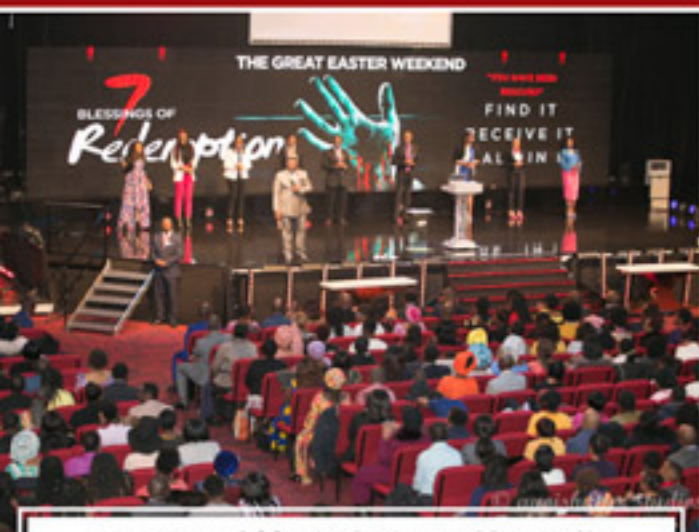
Page 3: Easter Celebration Service at KICC Prayer City