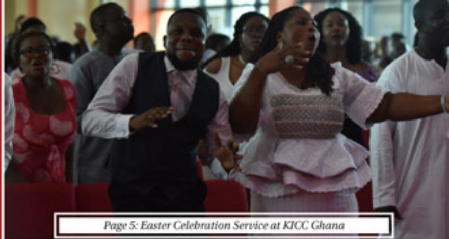
Page 5: Easter Celebration Service at KICC Ghana