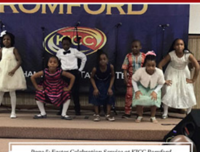
Page 5: Easter Celebration Service at KICC Romford