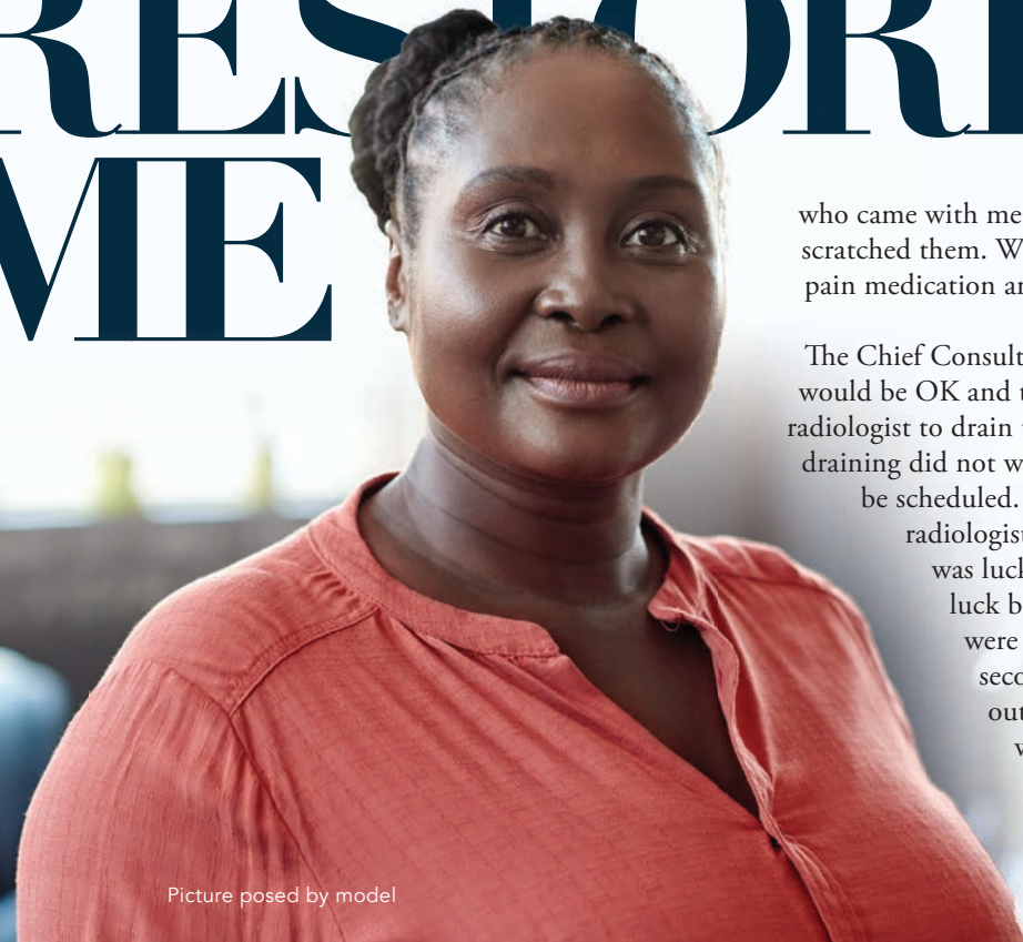
Picture posed by model

who came with me tried to calm me down but I even scratched them. When I was called, I was given more pain medication and told that I had an infection.