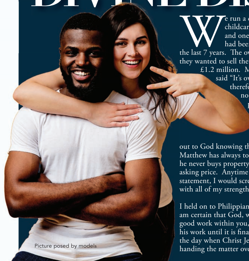
Picture posed by models

W e run a chain of childcare properties and one in particular had been rented for the last 7 years. The owners decided they wanted to sell the property for £1.2 million. My husband said "It's over 1 million, therefore, we will not buy the property."