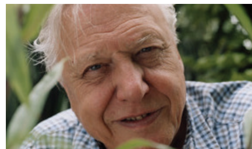
Discover more about the universe and the world with scientist Professor Brian Cox and natural historian Sir David Attenborough (above)

You can discover more about the earth and its oceans, the universe, the solar system, force and gravity at the click of the red button on your remote control! It's all thanks to BBC Bitesize's launch of some very cool programmes. Every day you'll find six different 20 minute shows on BBC iPlayer The programmes are for children aged between 5-7, 7-9, 9-11, 11-12, 12-13, and 13-14 years. Click here for more https://www.bbc.co.uk/bitesize/articles/z6vpnr