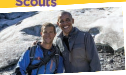
Bear Grylls with former American President Barack Obama. Mr Obama appeared on Bear's survival skills TV program Running Wild with Bear Grylls!

Chief scout adventurer Bear Grylls has teamed up with the Scouts to bring you more than 100 games, activities and creative ideas for free! Visit https://www.scouts.org.uk/the-great-indoors/ You may be indoors but there are loads of ways on this site to get mucky, get creative and even get covered in paint (sorry grown-ups!)