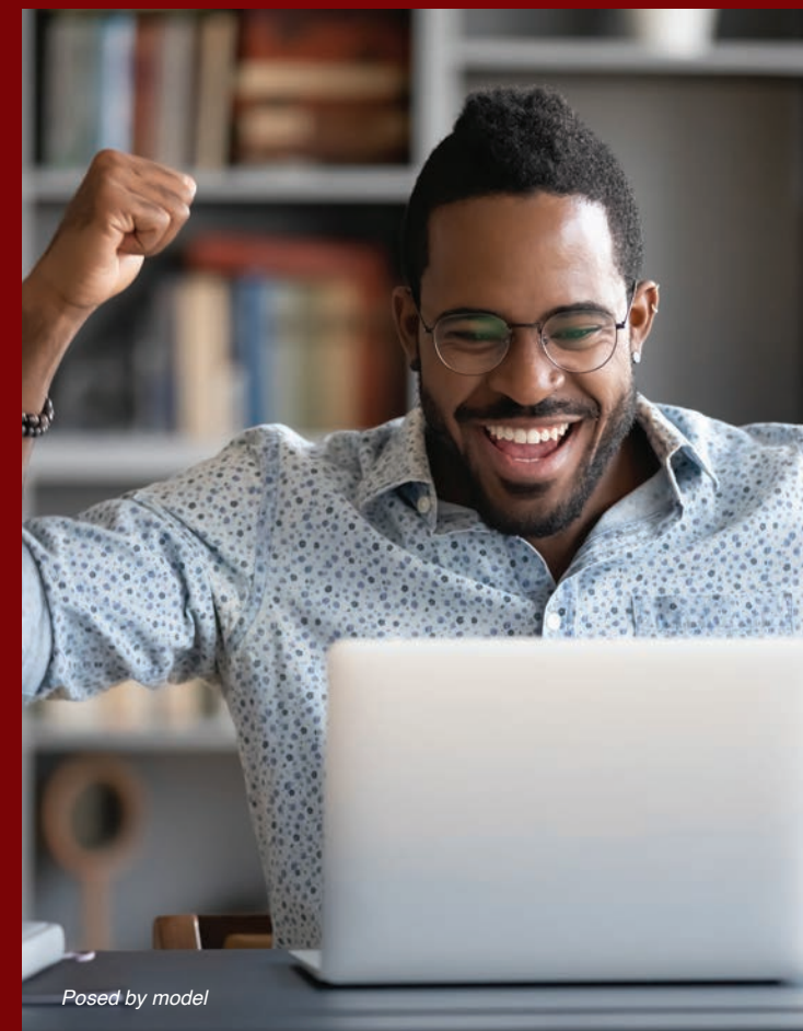
Posed by model

Blessed [fortunate, prosperous, and favored by God] is the man who does not walk in the counsel of the wicked [following their advice and example], Nor stand in the path of sinners, Nor sit [down to rest] in the seat of [b]scoffers (ridiculers)... Psalms 1:1-3