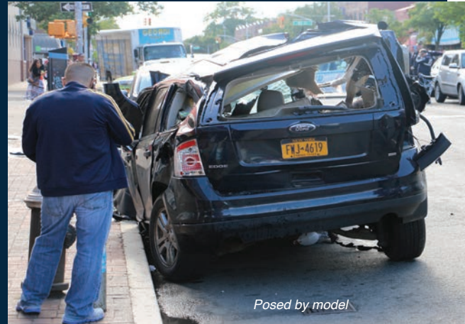
Posed by model