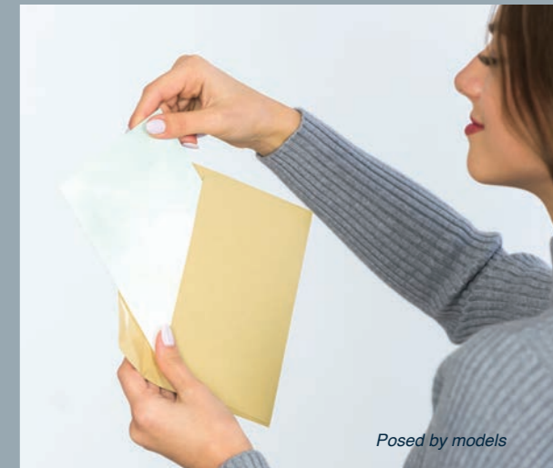
Posed by models