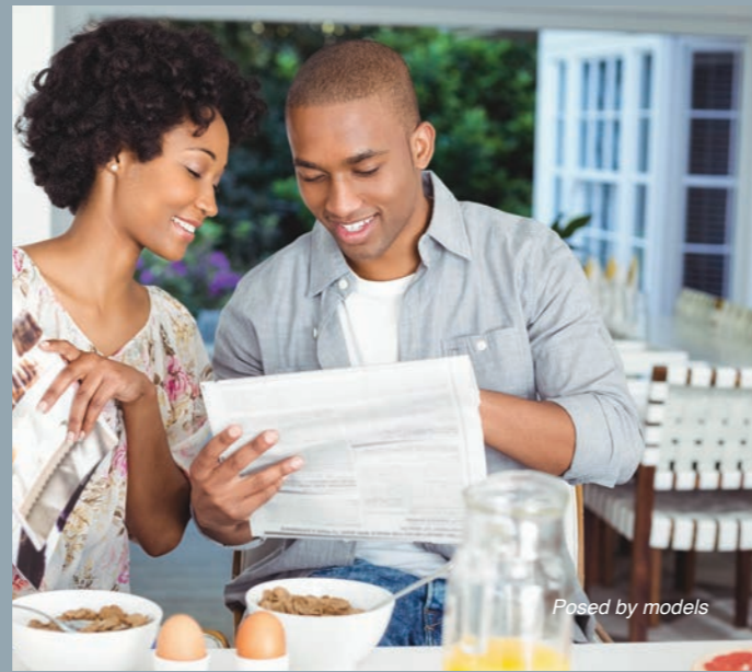
Posed by models