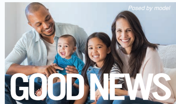
Posed by model

... I have opened a door for you that no one can close. You have little strength, yet you obeyed my word and did not deny me. Revelation 3:8