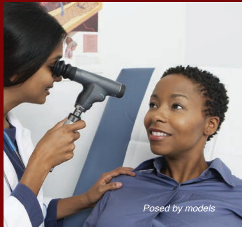
Posed by models

"there's someone watching and you are experiencing a back and forth challenge. Your miracle is here as there is a shift in the realm of the spirit." That word came alive in my Spirit and I screamed a loud Amen! The next day I received a call from a businessman