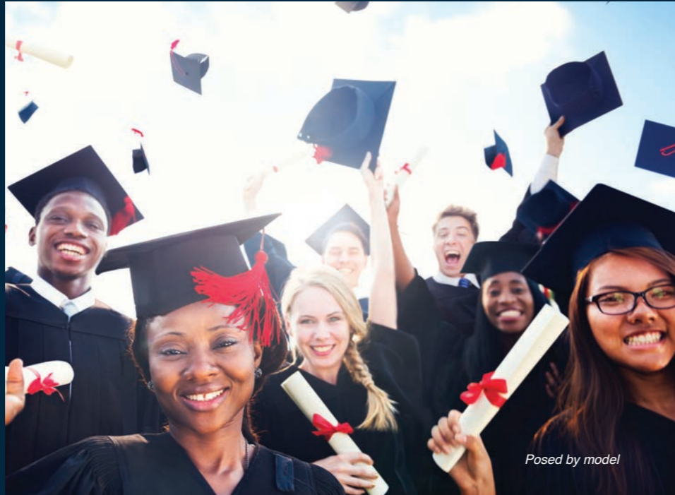
Posed by model