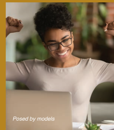
Posed by models

On day 86, I received a call from someone I have known for about four years. While we were talking, she offered me a job that would allow me to work from home on my laptop. She said "I don't know why I forgot that you do have been doing this work all these years. I could have employed you during the lockdown." We decided on a start date and she paid me in advance. She even brought in five other clients for me to work with.