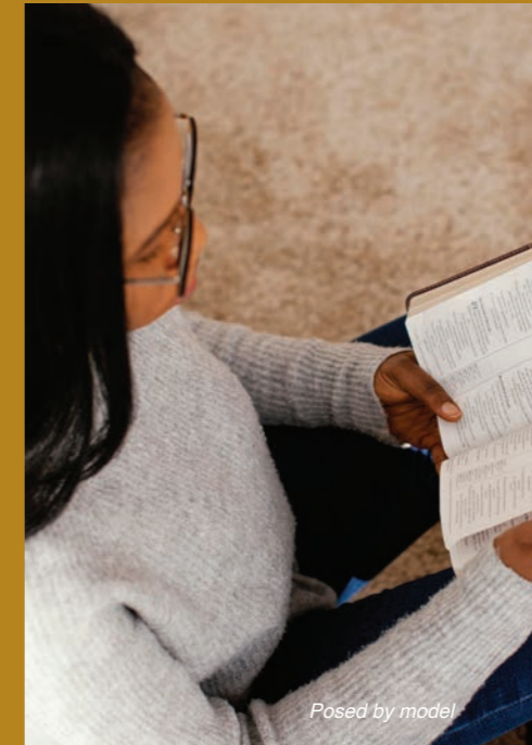
Posed by model