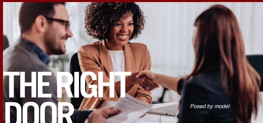
Posed by model

And without faith it is impossible to please God, because anyone who comes to him must believe that he exists and that he rewards those who earnestly seek him. Hebrews 11:6