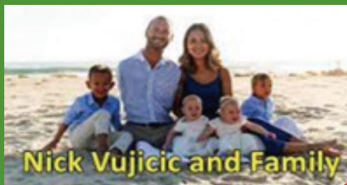
Nick Vujicic and Family

When he was thirteen, he read about how God helped another man with a disability to do great things by helping others. Nick then realised why God made him. Nick has since won bravery awards, travelled all over the world and given hope to thousands of people. Nick stuck with Jesus and allowed Him to do his super works through him. Eventually, lots of women wanted to marry him and Jesus led him to choose the right one. He is blessed with a beautiful wife and four children.